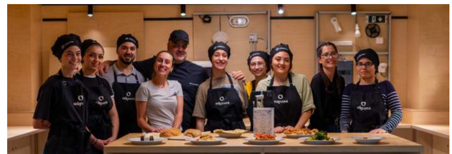
Participants in Odyssea's vocational training for technical trades