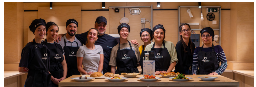
Participants in Odyssea's vocational training for technical trades