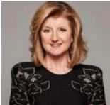
Arianna Huffington CEO and Founder, Thrive Global