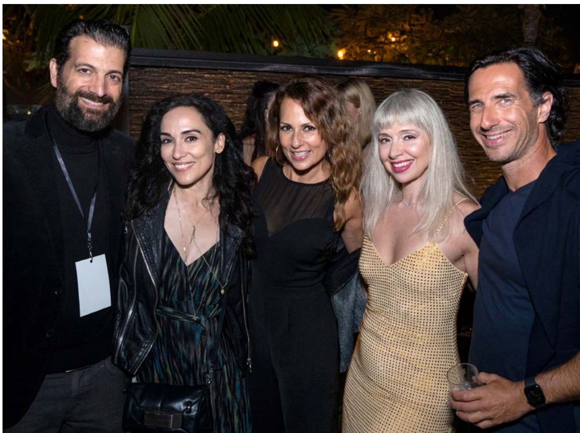
Los Angeles, California, June 2024