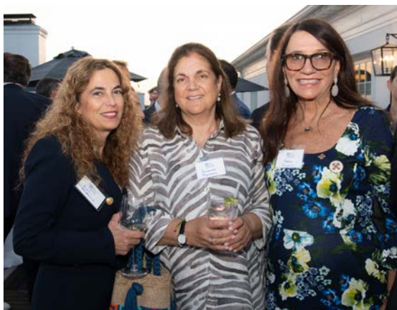
City, Connecticut • On September 12, 2024, an 1821 Society Cocktail Reception was held.