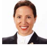
Ambassador Eleni Kounalakis