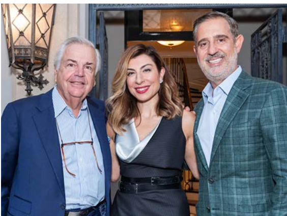
Los Angeles, California • On September 26, 2024, an 1821 Society Cocktail Reception was held.