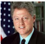
President Bill Clinton

Senior Partner, Gibson, Dunn & Crutcher LLP