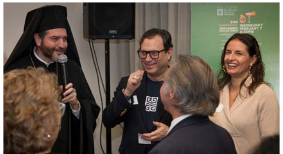
Washington, D.C., February 2024

from around the world. The view of the Acropolis at sunset was a perfect way to celebrate our growing global community.