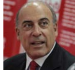
Muhtar Kent, Emeritus

Chief Executive Officer, The Red Apple Group