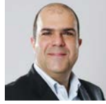
Sir Stelios Haji-Ioannou

Founder, Chairman and Global Chief Investment Officer, Calamos Investments