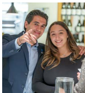
New York City, New York, December 2024