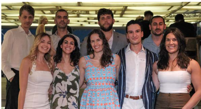
Athens, Greece, July 2024