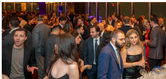
New York City, New York, April 2024