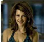
Nia Vardalos Actor, Writer, Producer, Director